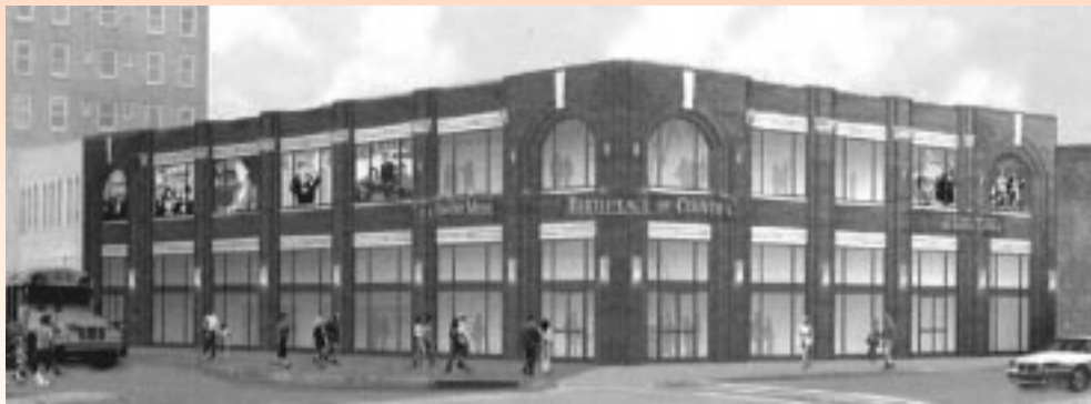
Artist's rendition of the Cultural Heritage Center.